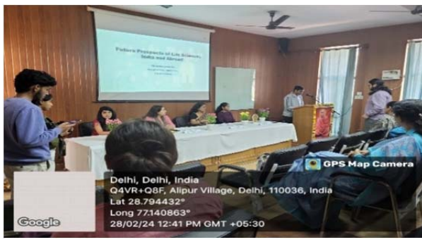
competition was Organised to ignite the scientific

temper in students, in which students from various science departments participated with commendable zest and enthusiasm.