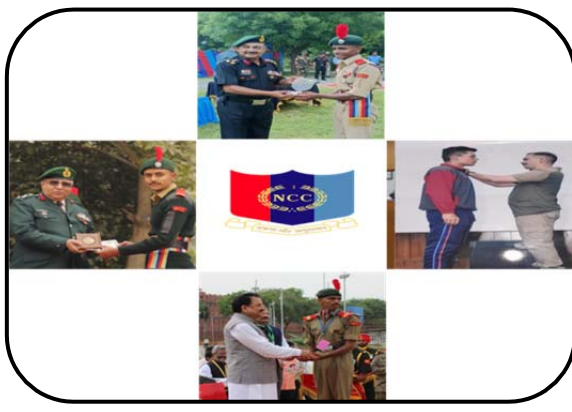
NCC – 1 DELHI NAVAL UNIT (BOYS + GIRLS)